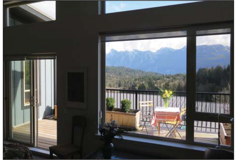
BREATHTAKING VIEWS AND A PRIVATE OUTDOOR DECK BRING YOU CLOSE TO NATURE.