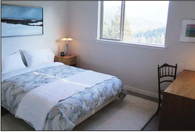
COMMUNITY LIVING ON THE CLOSEST ISLAND TO VANCOUVER. 20-MINUTES BY FERRY FROM HORSESHOE BAY: BELTERRA COHOUSING ON BOWEN ISLAND.